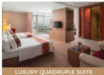
LUXURY QUADRUPLE SUITE