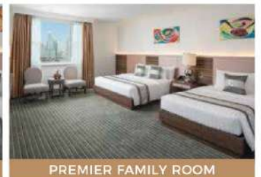
PREMIER FAMILY ROOM