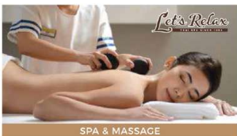
SPA & MASSAGE